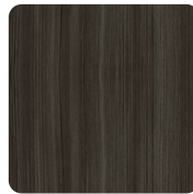
Grey Dusk GD