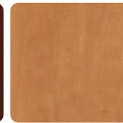
Sugar Maple SM