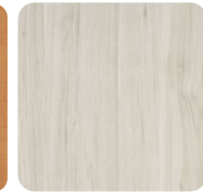
Winter Wood WW