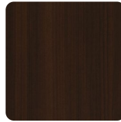
Evening Zen EZ