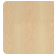
Hardrock Maple HM