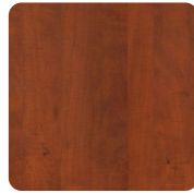
Autumn Maple AM