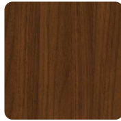
Black Walnut BW