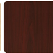
Royal Mahogany RM