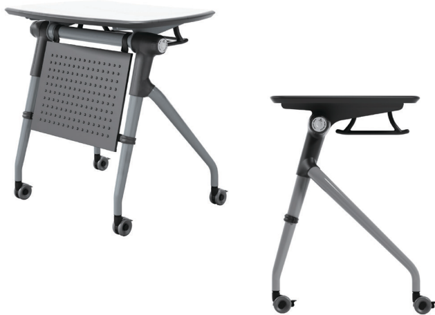
30" Wide Training Table Shown

Optional desktop connecting system available Sku: TU-98B-TGH