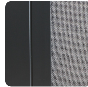
Charcoal Frame & Grey Panels